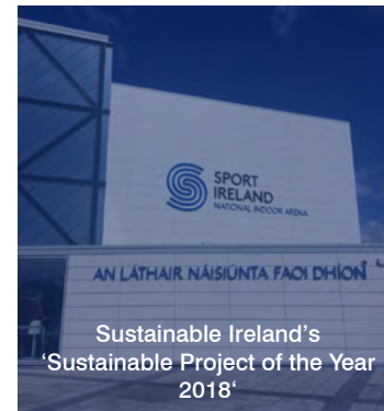
Sustainable Ireland's 'Sustainable Project of the Year 2018'

Launch of H&S Checklist on our Buildsmart software Top 5 H&S areas with most items logged are: • Unsafe practices • Gloves • General house keeping • Working at height & edge protection • PPE These areas are a key focus of training during 2018.