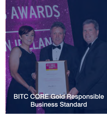
BITC CORE Gold Responsible Business Standard