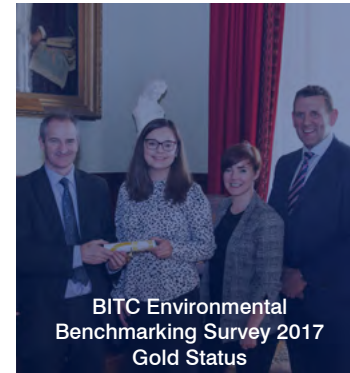
BITC Environmental Benchmarking Survey 2017 Gold Status