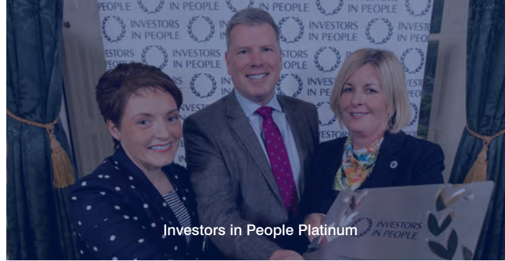
Investors in People Platinum