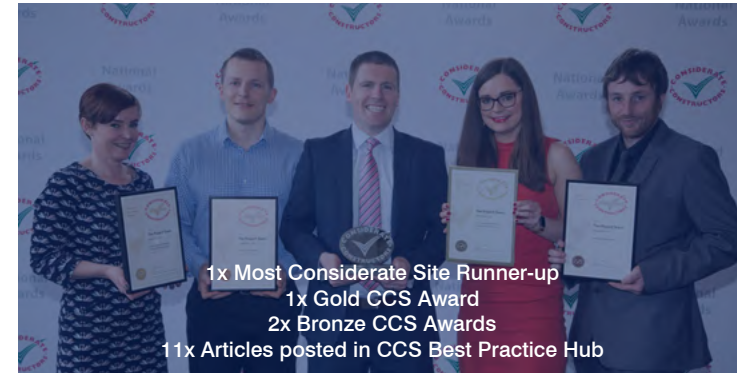
1x Most Considerate Site Runner-up 1x Gold CCS Award 2x Bronze CCS Awards 11x Articles posted in CCS Best Practice Hub