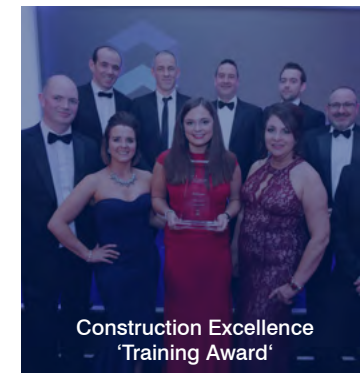
Construction Excellence 'Training Award'